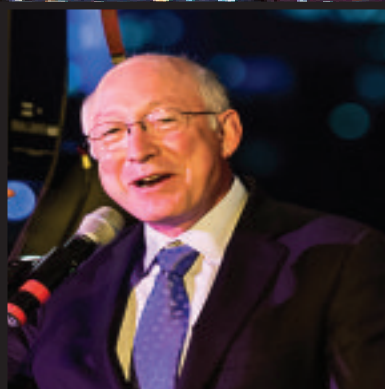
Ken Salazar 2014 Friend of the River Award Recipient