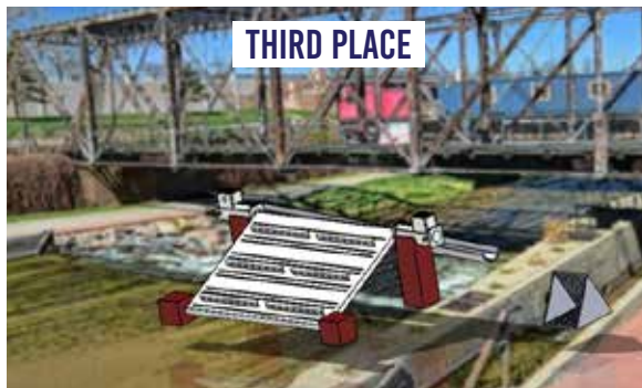
Go with the Flow from Colorado School of Mines

In 2017, teams of students from local universities were tasked with designing an in-stream trash removal device for Cherry Creek. Eight teams from three different institutions participated in Round 1, and three winners were selected!